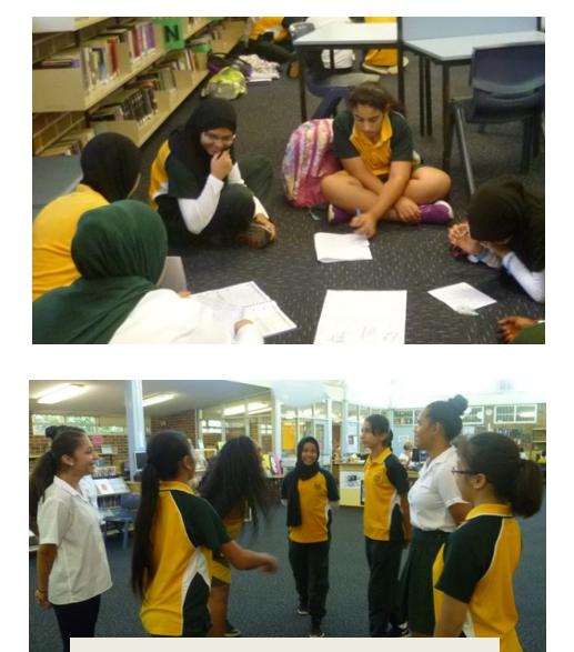
Peer Support session 2

The module we are following supports the National Framework for Values Education for Australian Schools' nine core values: care and compassion, doing your best, fair go, freedom, honesty and trustworthiness, integrity, respect, responsibility and understanding, tolerance and inclusion.