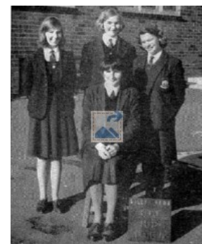
1965 Class Captains and Debating Team