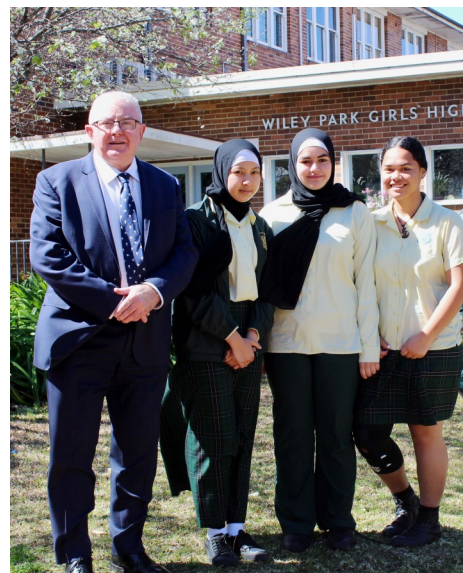
2018 School Leaders

At this meeting we will be having the election of the P&C committee for 2018.